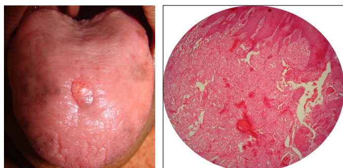
[Table/Fig-1]: Intraoral photograph shows single sessile growth on the dorsal surface of tongue in the midline. [Table/Fig-2]: H and E section at 10X showed stratified squamous epithelium with subjacent fibrovascular connective tissue showing aggregates of cells with granular cytoplasm.